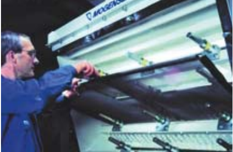
Test centre for screening trials