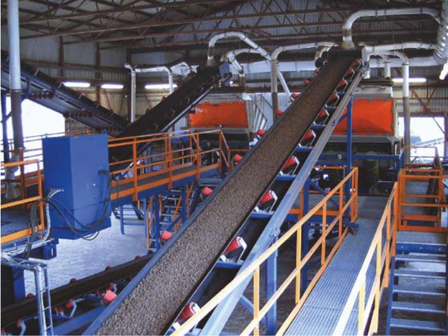
Screening plant in the gravel industry