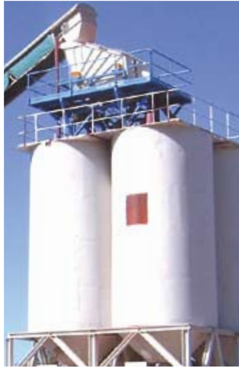
Screening plant in the stone and soil industry

The Fredrik MOGENSEN AB from Hjo, Sweden, joined the Allgaier Group in 1995 as an independent subsidiary. Much earlier, in the 1950s, the company had drawn attention to itself through the MOGENSEN Sizer. The compact design, high performance and easy maintenance were highly innovative in sieve technology and have remained as state-of-the-art technology.